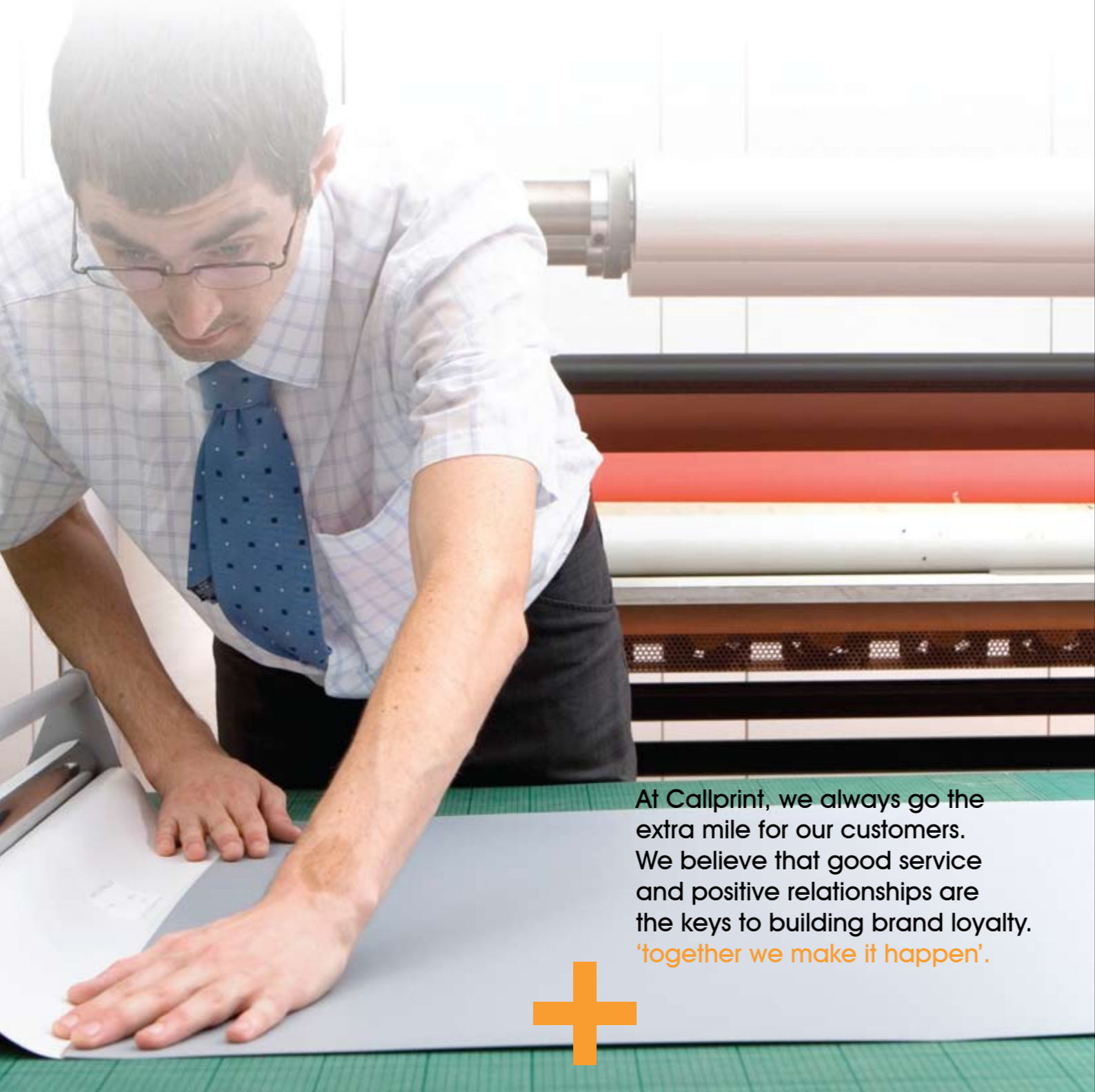
Image is everything, especially when you are exhibiting to current and potential customers. Our in-house print display team can custom design your graphics to suit your individual requirements. Initially, all we require from you is a sketch or written brief detailing your needs.

At Callprint, we always go the extra mile for our customers. We believe that good service and positive relationships are the keys to building brand loyalty. 'together we make it happen'.